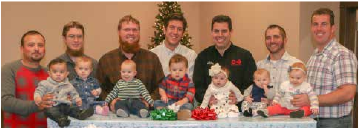
Here are all the new C&E babies within the last year. What a bundle of cuteness!