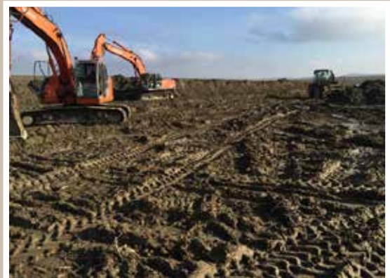
Mud, excavators and pipe to lay! Who says you can't live the dream?

Call us at 509-545-6940 to get a quote on a new stack yard.