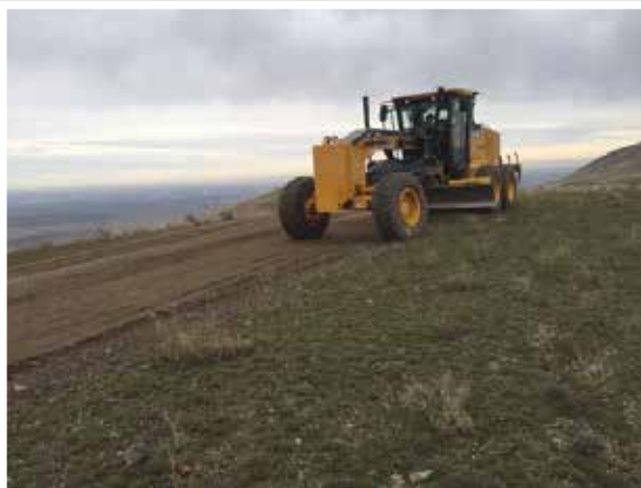
Same vineyard as above, spreading gravel on the access roads. This is going to be a world class vineyard with an old European flair!