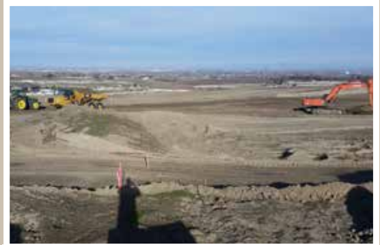
The start of a large pond with well over 20,000 yards moved to start. The view is overlooking Kennewick.