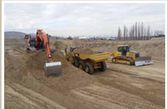
Same pond as above but further down in the hole. We have a ways to go. This is a big pond!