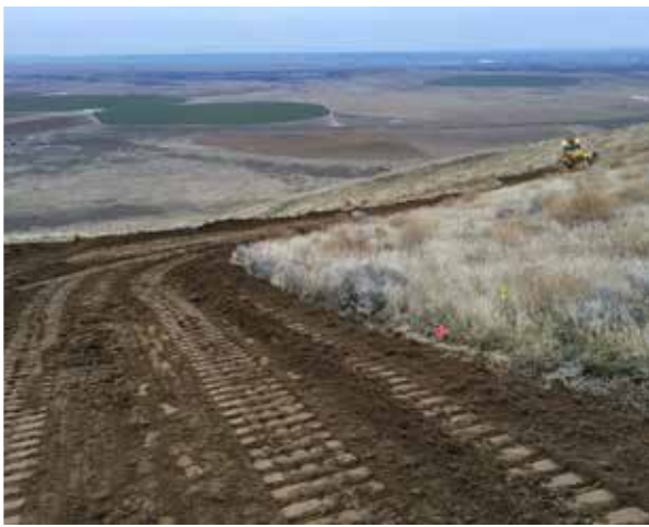
A new fire break / access road for a vineyard going in overlooking West Richland. What a view!