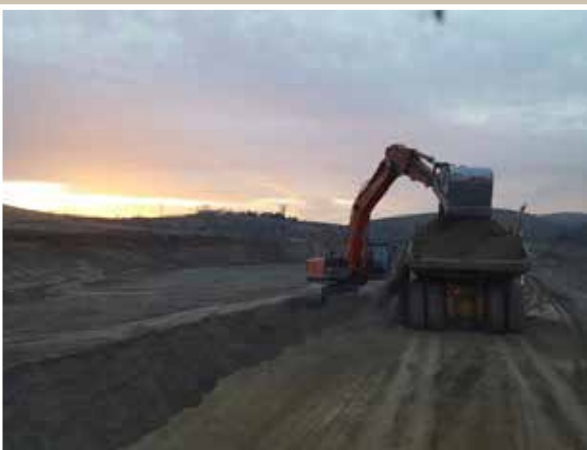
Moving dirt in the big pond as the sun sets. Maybe we will have final photos for you next month. Stay tuned!