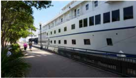
You can just see the blue Ocearch 20 feet off the stern, past the cruise ship.