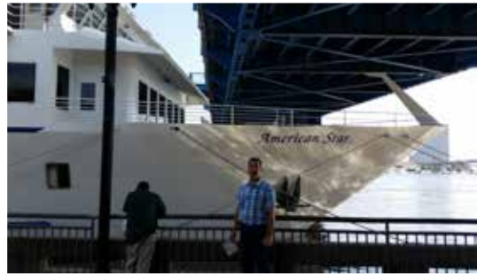
We had fun watching this ship dock. As you can see, it is only 10 feet from hitting the bridge. Behind it is the Oearch ship, talked about in this article, with a gap of about 20 feet. Amazing!