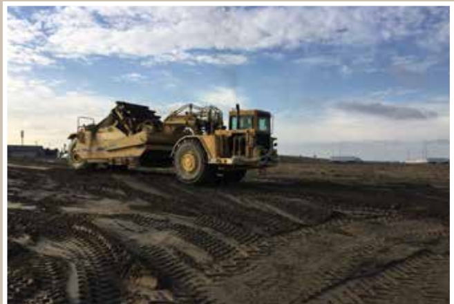
Putting a new (to us) scraper through its paces! We are excited to add another scraper to our fleet giving us a few more options to support your project better!