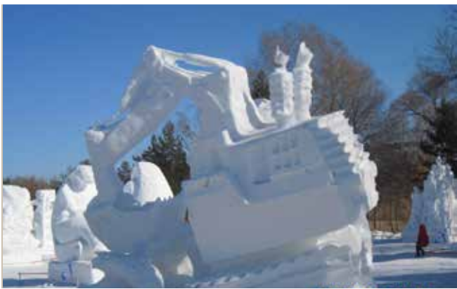
This was a snow creation at a snow festival in Heilongjiang, China. Amazing talent.