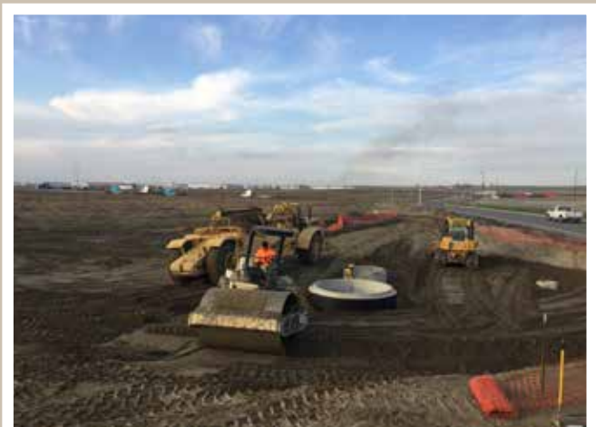
Trying to show the fun of a busy project with several machines working in tight quarters and talented operators moving almost as one. It is a beautiful thing!