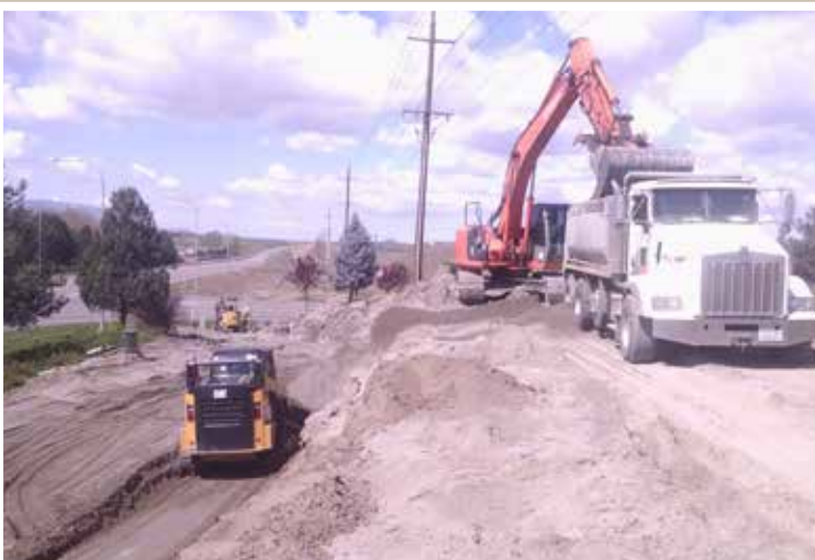
The beginnings of the new walking path. See picture on right for the almost finished product.

At an 8-year old baseball game, I'm standing beside a gentleman who is heckling the young umpire over his ball and strike calls. After the second kid gets out, he turns to me and says, "That was my grandson who just got called out on that third strike." Then he said, "Who are you? Are you from the other team?" I replied, "No, I'm the umpire's mom." We both enjoyed a laugh. However, I think I enjoyed it more than he did.