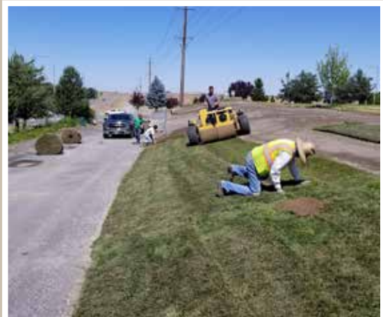
Putting the final touches on a new asphalt bike/walking path in Richland. Our thanks to the City of Richland for letting us partner with them on this project.